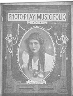
Photo-Play Music Folio

Each volume contains a large variety of Photo-Play Music for almost any occasion and the pieces are arranged in such a way that they may be repeated as often as desired.